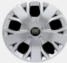
16" steel wheels with fullsize wheel cover