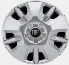
15" steel wheels with fullsize wheel cover