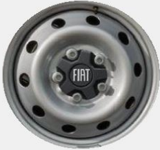
15" steel wheels with half wheel cover